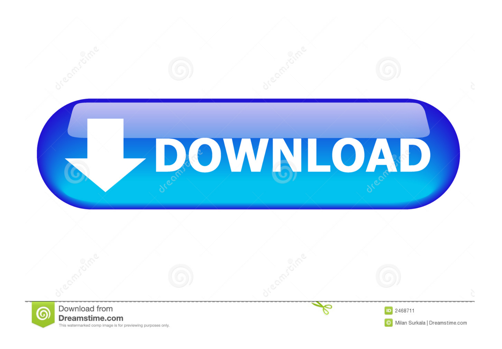
UTorrent 3.5.5 Build 45574 Crack With Keygen [Latest Version]