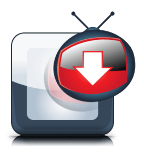
UTorrent 3.5.5 Build 45574 Crack With Keygen [Latest Version]